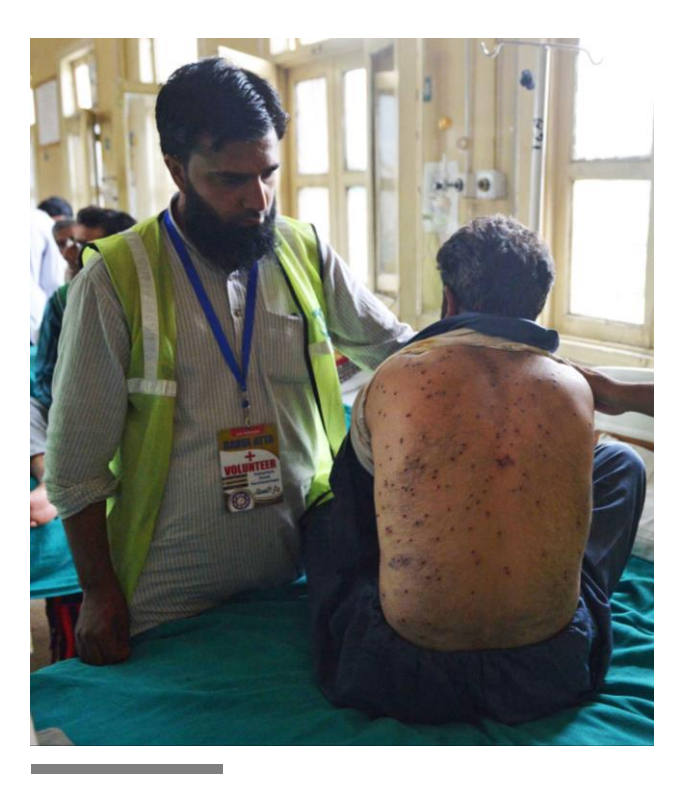
A wounded Kashmiri man shows his injuries at a hospital in Srinagar after being hit by pellets fired by Indian security forces during a protest in September 2016.

performed there, with ongoing treatment for at least 53 people with more severe eye injuries. 49 Doctors told PHR that, in many cases, they had to perform more than one surgery to treat the eye injuries.