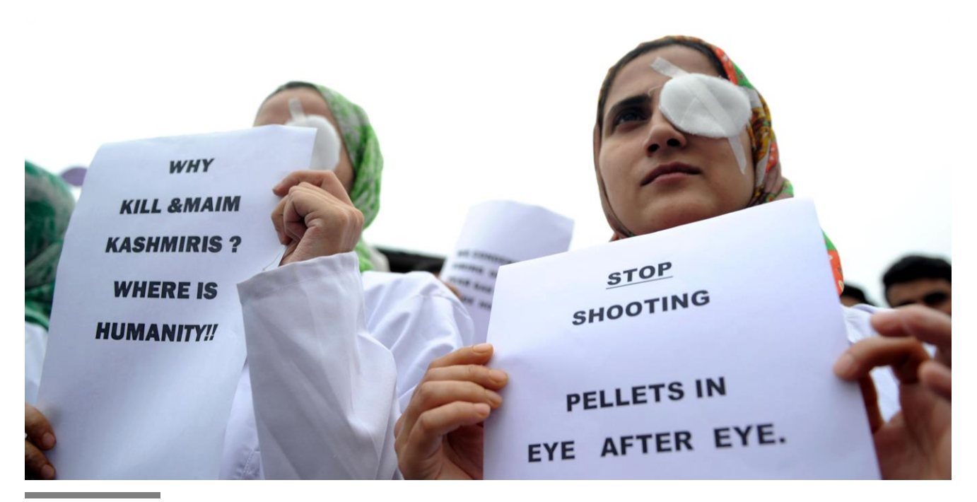
Kashmiri doctors and paramedics protest at a hospital in Srinagar in August 2016. The protesters wore eye patches to emulate the plight of the victims of pellet guns, who have been left partially or completely blind after being shot by Indian security forces during protests.

In August 2016, the Ministry of Home Affairs in Delhi again constituted an expert committee to examine the use of 12-gauge shotguns against protesters in response to an international outcry following reports of the hundreds of serious injuries, particularly to the eye, sustained by protesters. Although the committee's full report has not been made public, some recommendations made by the committee and reported in the media state that the use of 12-gauge shotguns should be replaced with the use of chemical irritants, namely a synthetic pepper gas called PAVA. However, one of the committee members did state that the 12-gauge shotguns were "here to stay," and recommended that only pellets composed of polymer, plastic, and rubber be used, not metal, as has been used since 2010.12