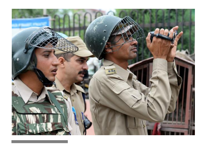
Indian troops film a protest in Srinagar in August 2016.

The right to health under international human rights law mandates that the state take measures to protect the functioning of health services and ensure they continue delivering health care to the highest attainable standard. 66 Police presence in hospitals, with the intention of arresting the injured for participation in protests, constitutes state interference with the delivery of health care. Such actions risk increasing the rates of death and