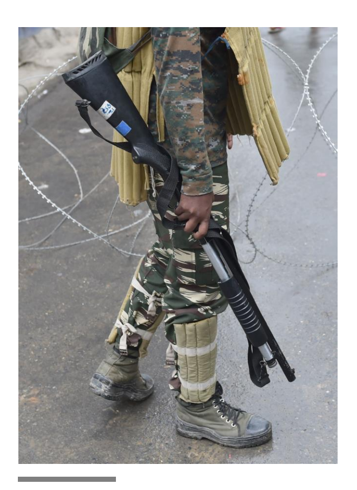
An Indian paramilitary trooper holds a pellet gun during a curfew in Srinagar in August 2016.

To learn more about the potentially devastating effects of crowd-control weapons, read our report "Lethal in Disguise" at phr.org/lethal-in-disguise.