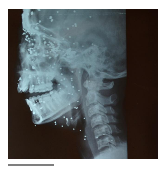
An x-ray of Kashmiri teenager Insha Malik after she was shot by Indian security forces, showing multiple pellet marks on her face which have left her blind in both eyes.

According to media reports, statistics from the Jammu and Kashmir Department of Health show that 837 of the estimated 12,000 people injured during protests since July 8, 2016 had sustained eye injuries, in one or both eyes, from No. 9 shot. In addition, 4,371 people were admitted to hospitals in Kashmir with injuries inflicted by pellets elsewhere on the body. 44 The breakdown of the types of injuries for the other 6,792 injured is not publicly available; however, interviews with individual doctors and hospital administrators indicate that hospitals also treated protesters with traumatic injuries inflicted by live bullets and tear gas shells.