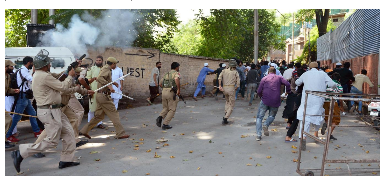
Indian government forces fire tear smoke shells towards Kashmiri protesters in Srinagar in July 2016.

Although "unlawful assembly" is defined in the Jammu and Kashmir Ranbir Penal Code as an assembly of five or more persons with criminal intent, section five of the Armed Forces Special Powers Act 1990 (AFSPA) makes any assembly of five or more people unlawful, regardless of intent, and empowers military personnel to use lethal force to disperse the assembly.30 Special provisions in the AFSPA and the Code of Criminal Procedure requiring prior permission from the government to prosecute law enforcement and security forces have been used since 1990 to protect law enforcement officers and other security force personnel from prosecution in cases where police or military action resulted in death. These include situations where police or other security forces were called upon for crowd control.31 In Jammu and Kashmir, special security legislation, including the AFSPA and the Public Safety Act (PSA), which allows for detention without charge or trial for up to one year, have been used to target protesters, and have encouraged the use of excessive force and arbitrary detention with impunity.32 The AFSPA and PSA have been widely criticized by the international community, and both violate India's obligations under the International