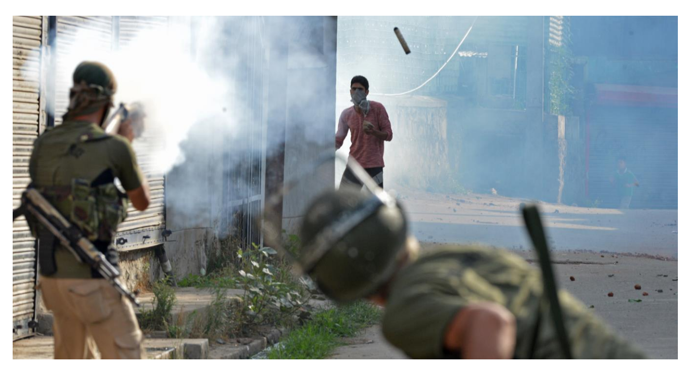
Indian police fired tear smoke shells towards Kashmiri protesters in Srinagar during a protest in August 2016 against civilian killings.

The level of violence in Jammu and Kashmir drew fierce criticism from the international community; however, the use by security forces of the purported "less than lethal" 12-gauge shotguns, misleadingly