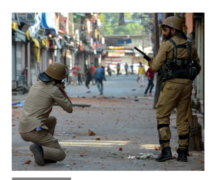
Indian police clash with Kashmiri protesters in Srinagar in July 2016.

The weapons and tactics used to disperse assemblies also fail to meet international standards on proportionality in assessing the use of force against protesters. According to international principles, the fact that an assembly may be considered unlawful does not justify the use of crowd-control weapons; even when protesters do engage in or incite violence justifying police intervention, the explicit goal of intervention should be to de-escalate the situation, and to promote and protect the safety and rights of those present at the protest. Finally, the crowd-control weapons deployed should always be proportional to the threat faced.<sup>21</sup>